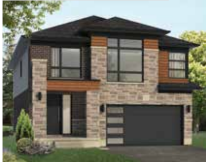
THE WILDWOOD 40'

2796 sq. ft. | 4 2.5 2 $749,900 | *Showing Package 3