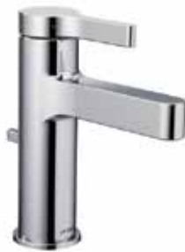
Model: 6710 Vichy Chrome One-Handle Bathroom Faucet