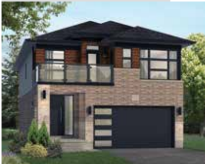
THE BROOKSTONE 36'

2379 sq. ft. | 4 2.5 2 $679,900 | *Showing Package 4