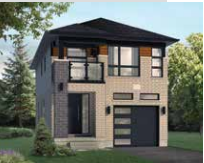
THE BROOKSIDE 30'

2009 sq. ft. | 3 2.5 1 $624,900 | *Showing Package 5