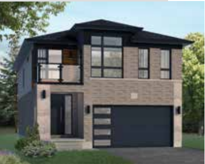
THE ELDERBERRY 36'

2452 sq. ft. | 3 2.5 2 $684,900 | *Showing Package 2