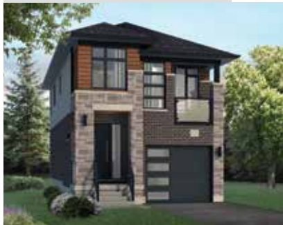
THE SANDRIDGE II 30'

1971 sq. ft. | 3 2.5 1 $619,900 | *Showing Package 3