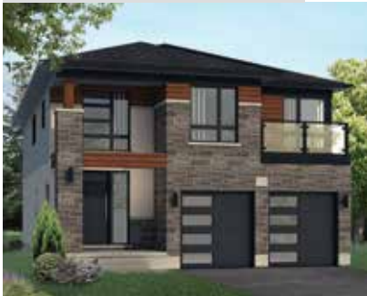
THE MAYSTREAM 40'

2760 sq. ft. | 4 2.5 2 $759,900 | *Showing Package 1