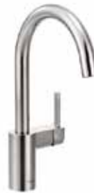
Model: 7365 Align Chrome One-Handle High Arc Kitchen Faucet